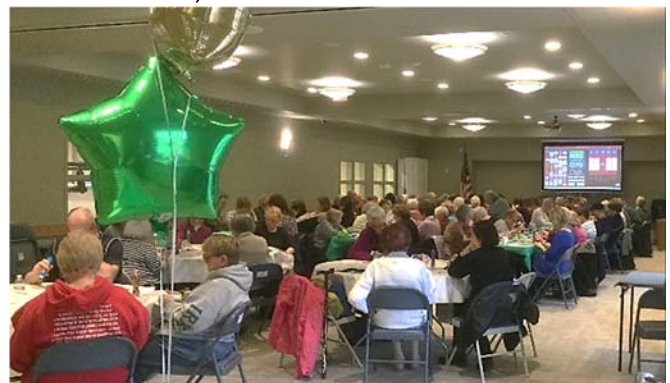
THANK YOU TO ALL OUR VOLUNTEERS AND BINGO PLAYERS!