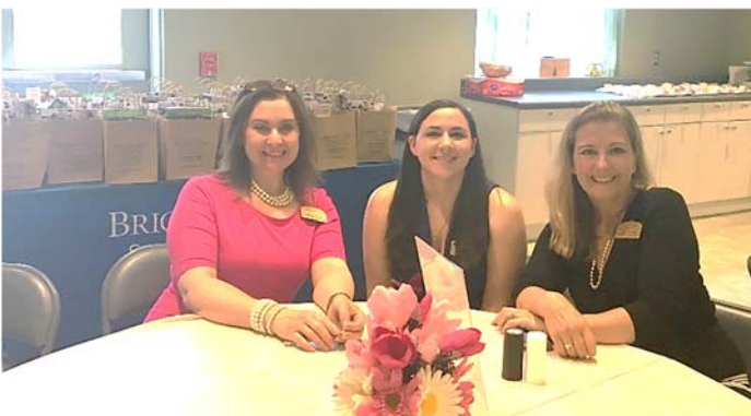
The ladies from BrightView and Home Helpers