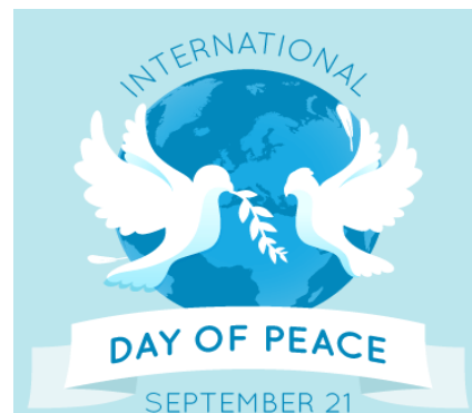
SEPTEMBER 21, 1981 - INTERNATIONAL PEACE DAY. CREATED AND SPONSORED BY THE UNITED NATIONS TO SEEK AN END TO WAR AND VIOLENCE.