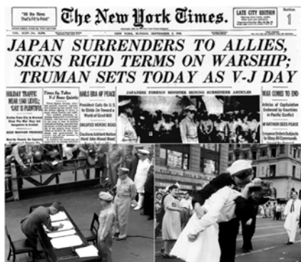
SEPTEMBER 2, 1945 - VJII DAY. FORMAL JAPANESE SURRENDER CEREMONY HELD IN TOKYO BAY ABOARD THE USS MISSOURI.

Our members knit caps for premie babies at St. Christopher's Hospital for Children . You can join the group here at the Center on Tuesdays at 1:00 PM or you can take the yarn and do your knitting at home. Hat pattern is available.