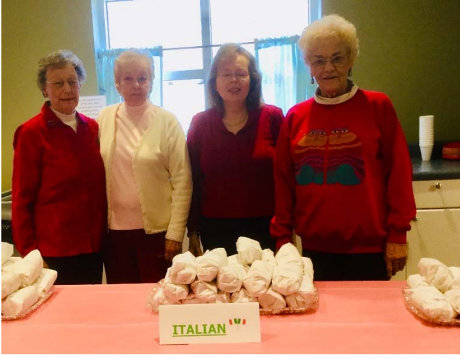
MORE VOLUNTEERS! WE THANK YOU!