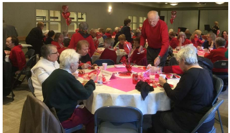
GREAT PARTY! FUN CROWD!